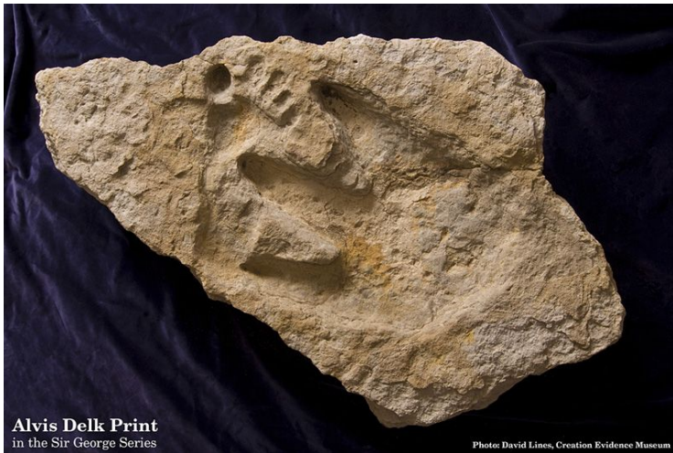
Alvis Delk Print in the Sir George Series