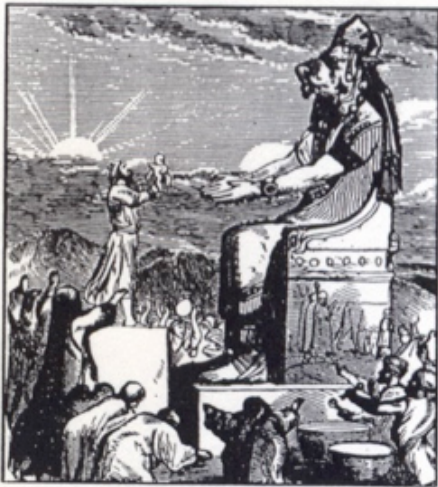
Baby being offered to the heathen god Molech

of Christianity. Because many of these places continue the pagan rituals and worship of old, the baptism and dedication of children and adults there is nothing more than heathen baptism, and dedication to the gods of the pagan religions, under the covering of a so-called Bible Believing church of Yahveh. Anyone baptized in one of these organizations commonly called Christian churches, need repent and renounce such a practice by a pagan religion. The mikvah/baptism is a holy ceremony of great importance in the life of a Believer and must be done in reverence to the only true God, Adonai, the Holy one of Israel, in the name of His Son, Yeshua.