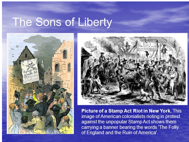
Picture of a Stamp Act Riot in New York. This image of American colonialists rioting in protest against the unpopular Stamp Act shows them carrying a banner bearing the words 'The Folly of England and the Ruin of America'.