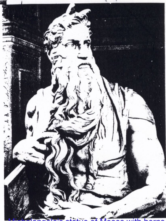
Michelangelo's statue of Moses with horns at St. Peters Basilica

There is a statue of Moses in St. Peters Basilica, the supposed great Roman Catholic church of Rome that has horns on it. Can you even imagine the audacity, the abomination. How is it possible for any Roman Catholic person with half a brain to accept this kind of demonic idolatry right in their supposed Mother Church? Imagine how hard it must be for a follower of Rome to see this and continue to follow such a pagan religion.