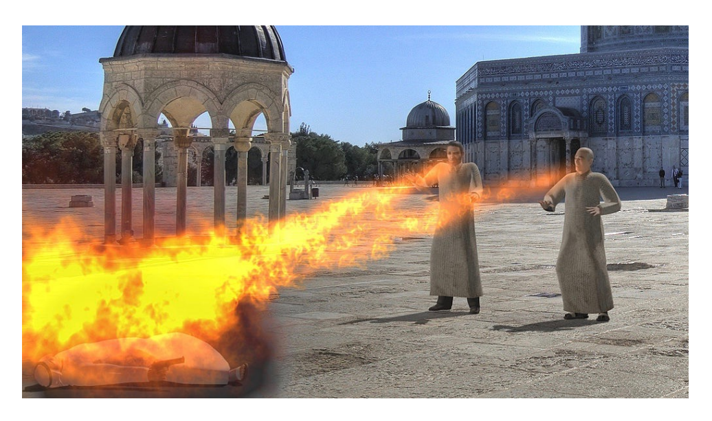
Rev. 11:6 says, "They have authority to shut up the sky, so that no rain falls during the period of their prophesying; also they have the authority to turn the waters into blood and to strike the earth with every kind of plague as often as they want." The two witnesses have the power to destroy their enemies with fire and

Revelation 11:5 says that if anyone tries to harm them, fire comes out of their mouth and consumes their enemies.