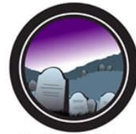
Death of First-Born Exodus 11:1-12:36