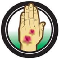
Unhealable Boils Exodus 9:8-12

Copyright Logos Bible Software 2008 Artwork by Aaron Schrade