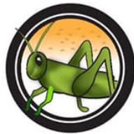
Locusts Exodus 10:1-20