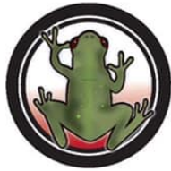
Amphibians (Frogs) Exodus 7:26-8:11