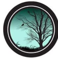
Darkness Exodus 10:21-29