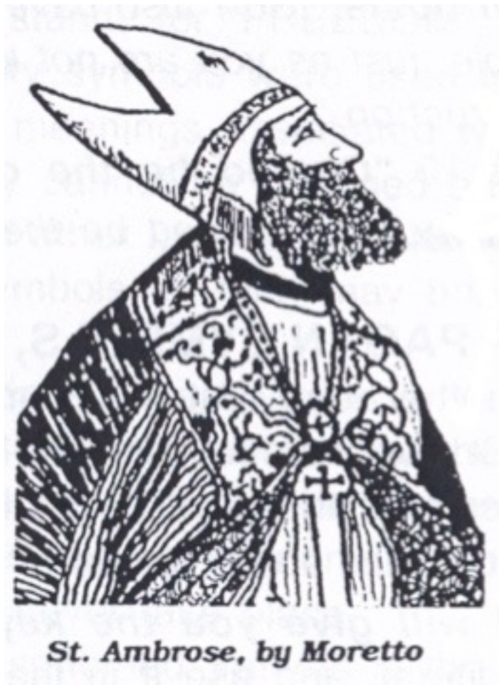
St. Ambrose, by Moretto

If you look at the letter "nun" in Hebrew you will find an action word pictured as a fish. In Aramaic this symbol was said to be secretly used to represent the Messianic's in the first century. Many say Yeshua was referring to the fish symbol as the sign of Jonah. This is why many Christians claim it represents Christianity. The problem is, Christianity has never existed in scripture. That word should always be translated to Messianic. The symbol remains questionable.