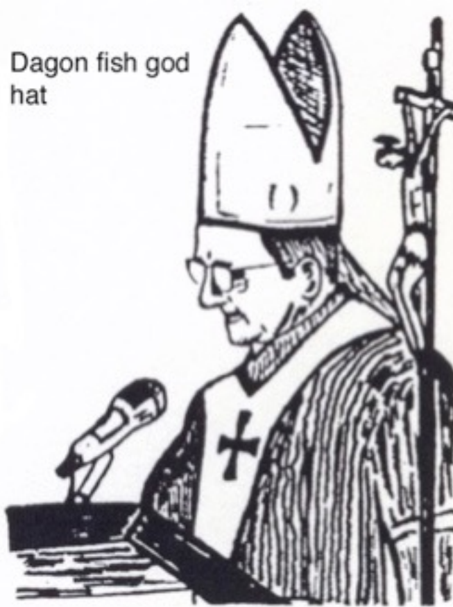
Pope Paul VI wearing mitre.

the church of Rome and archaeologists have seen that this was not correct. When in Rome a guide can show you the catacombs and explain the story and show you how this error is not really possible to have been right. One of the main points is that if they had really been in these catacombs they would have all been slaughtered by the Roman legions. All the tunnels and chambers were mapped out and well known.